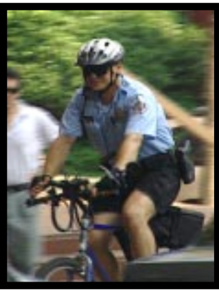
Deploying 287 new police mountain bikes is bringing added visibility and flexibility to community policing.