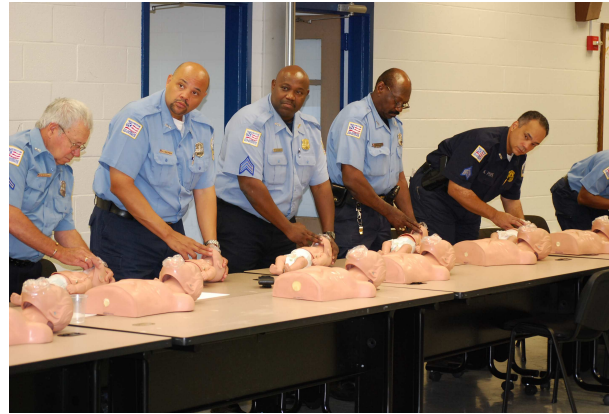
Reserve Corps Members Attending Training