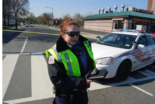
Reserve Officer Directing Traffic